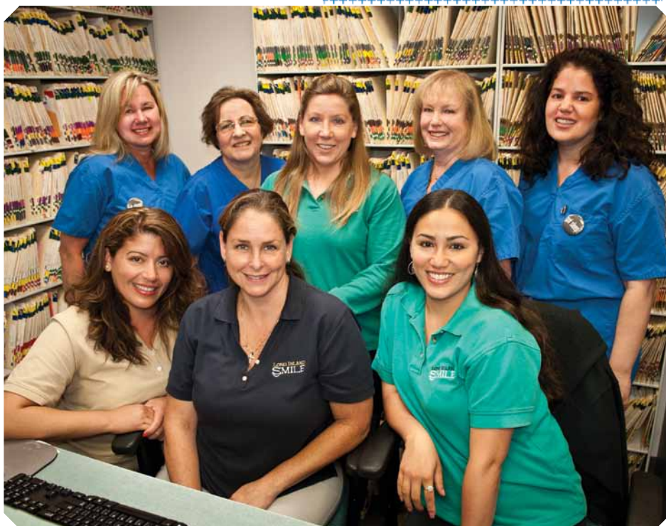
The highly qualified Long Island Dental Sleep Medicine staff

To learn more about Long Island Dental Sleep Medicine, visit www.longislanddentalsleepmed.com . ■