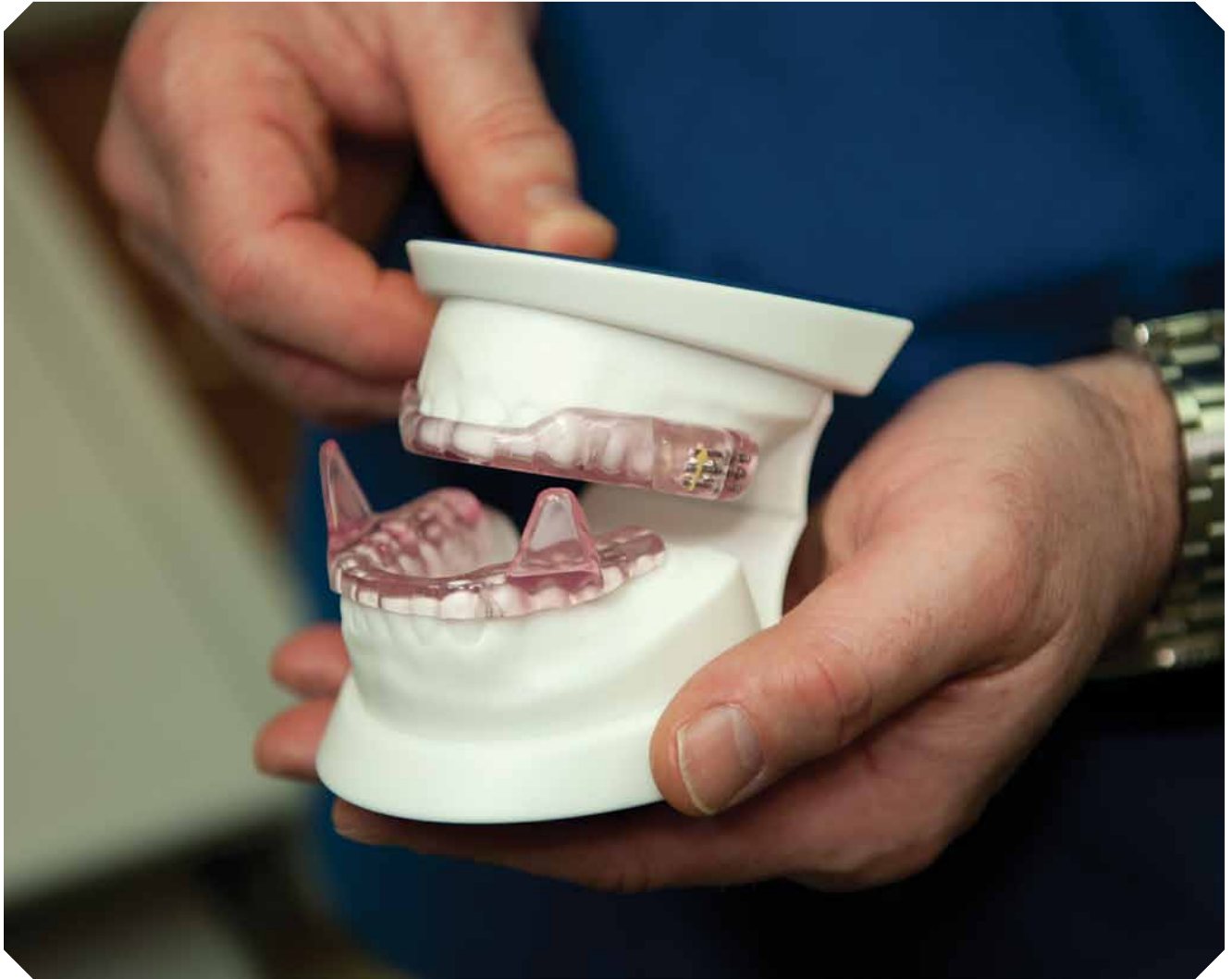
One of many custom oral appliance designs approved by the FDA for the treatment of obstructive sleep apnea